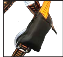
SUSPENSION TRAUMA POUCH