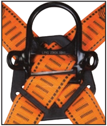
DORSAL BARR D RING