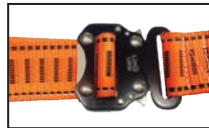
QUICK RELEASE BUCKLES