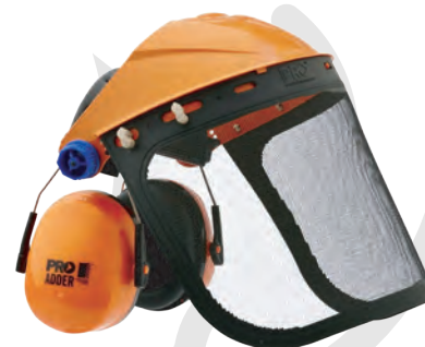
BGVMADD - MESH VISOR