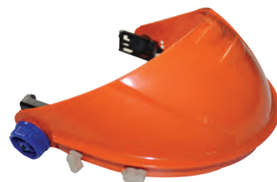
PRODUCT CODE : BG-NH