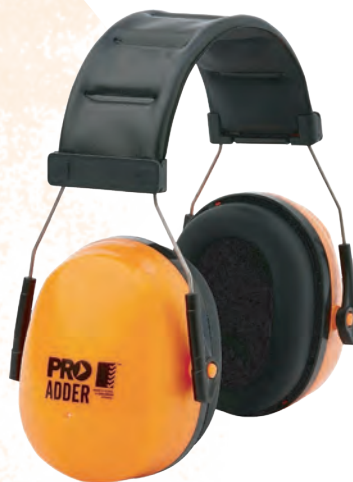
PRODUCT CODE : EMADD

TO SUIT ONLY Pro Choice VC, VS, VS5, VCE, & VM visors