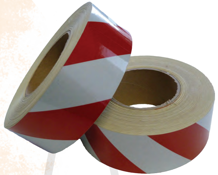
PRODUCT CODE : RW5050-R (50mm x 50m)

Material : Polyethylene Material Thickness : 90µm UV Treated : Yes Width : 50mm Length : 50m